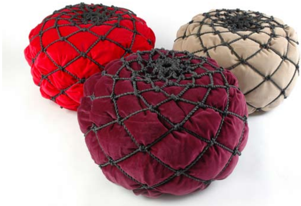
3 Caught Pouffe , Barley Massey, 2008 Photo: James Champion, 2008