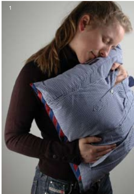
1 Barley Massey with Forget-Me-Not cushion from the Remember Me range, Barley Massey, 2008 Photo: James Champion, 2008