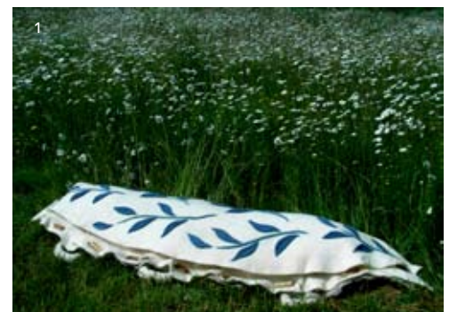
1 Leafshroud felt coffin by Yuli Somme and Anne Belgrave, 2007 Photo: Anne Belgrave, 2007