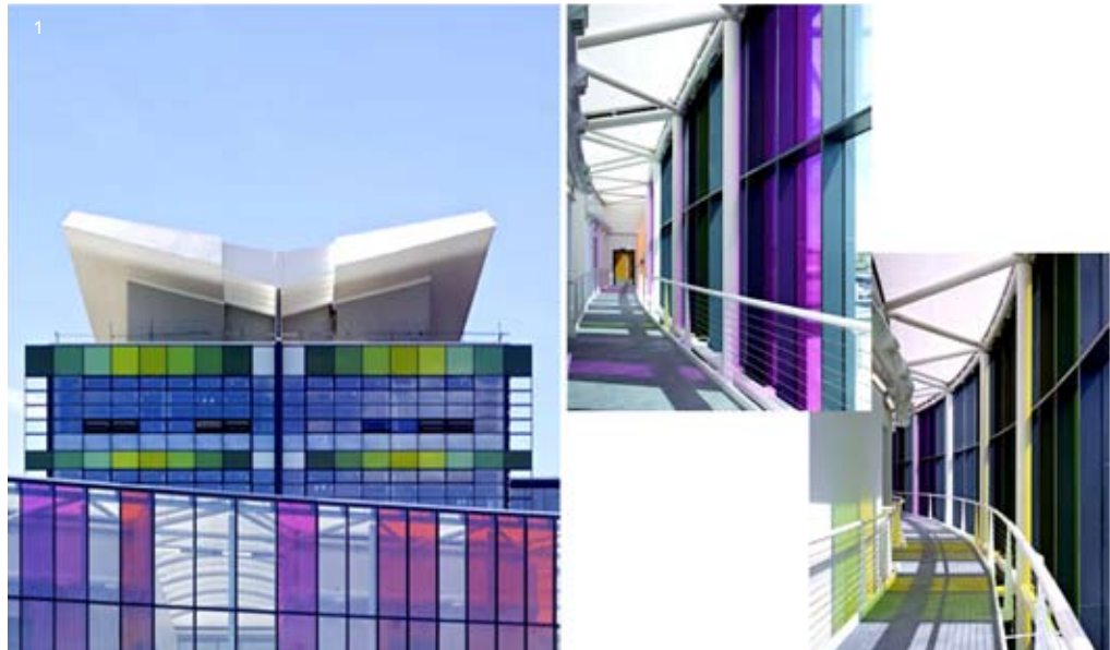
1 Kings Mill Hospital woven façade colour concept. Colour specification by Ptolemy Mann, for Swanke Hayden Connell Architects, Nottinghamshire, 2006 Photos: Timothy Soar, 2008

We discover the influence of materials knowledge on sectors ranging from interior design and architecture, to tourism and retailing, and throughout, we see a business model where there is little distinction between creative and commercial work, but where materials knowledge and the capacity for innovation it unlocks is crucial.