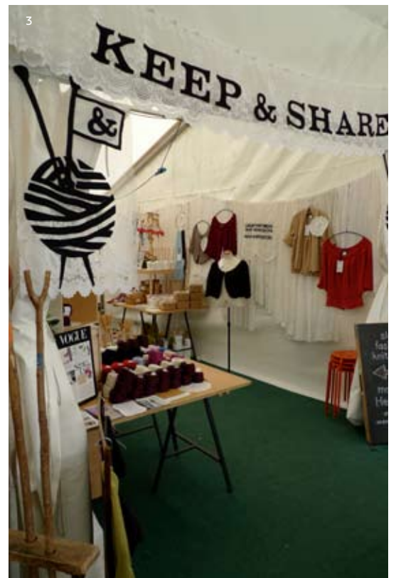
3 Keep & Share Travelling Store at Hay-on-Wye Literary Festival, Amy Twigger Holroyd, 2009