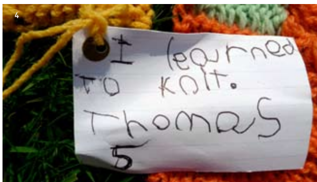
4 Workshop participant's work with Amy Twigger Holroyd at Latitude Festival, 2009