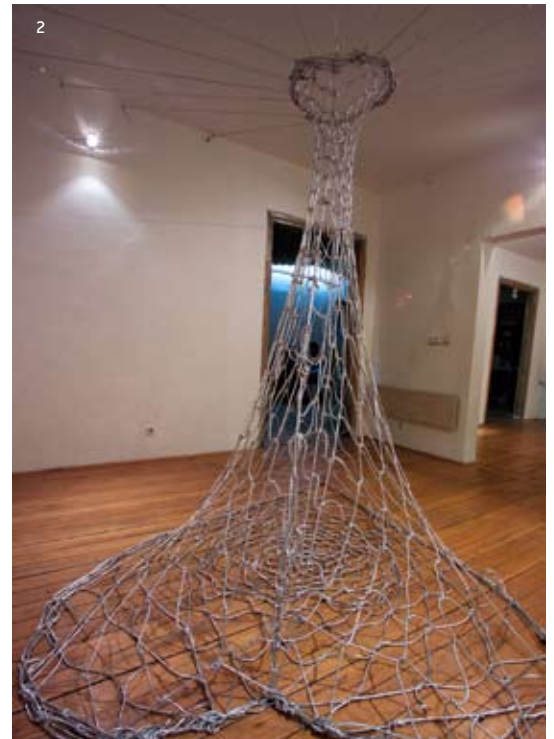
2 Lonely heart agency installation, Nada Prlja, with fabrication by Barley Massey, 2004