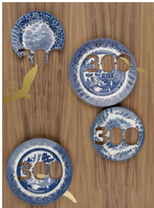
300 plates, from the Feeding Desire collection, Cj O'Neill, 2007