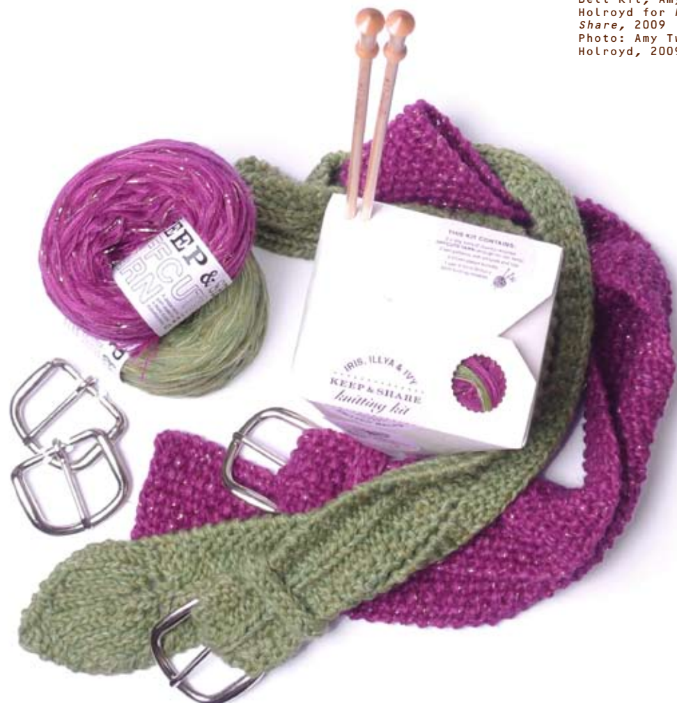
Belt Kit, Amy Twigger Holroyd for Keep & Share , 2009