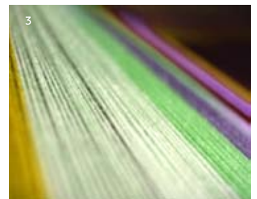
3 Warp Threads, Ptolemy Mann, 2006