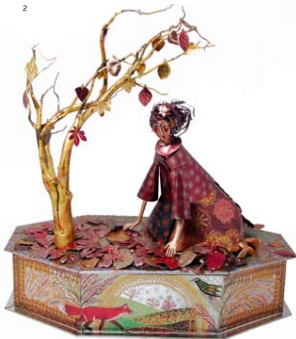
2 Angharad October, Melanie Tomlinson, 2008 Photo: Bogdan Tanea, 2008