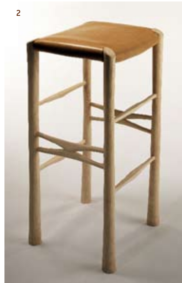
2 Wishbone Stool, Guy Mallinson, 2008