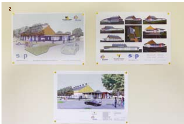
2 - 4 The New Bewbush Healthy Living Centre, Crawley - glass fabrication and installation meeting and site visit. Susan Kinley, 2010 Photos: Tas Kyprianou, 2010