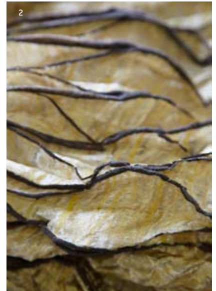
2 Distressed, metallic silk, rusted and pleated, Arantza Vilas, 2007