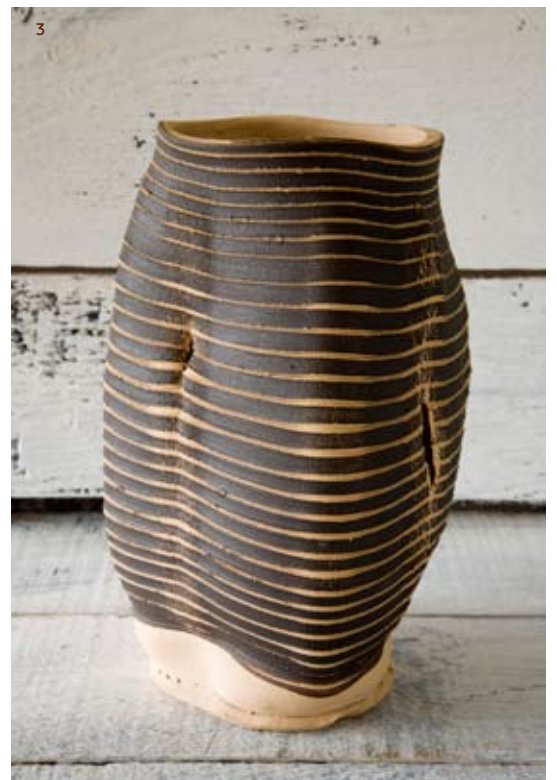
3 Black stripey pot, showing influence of Jon's work in community settings, 2009