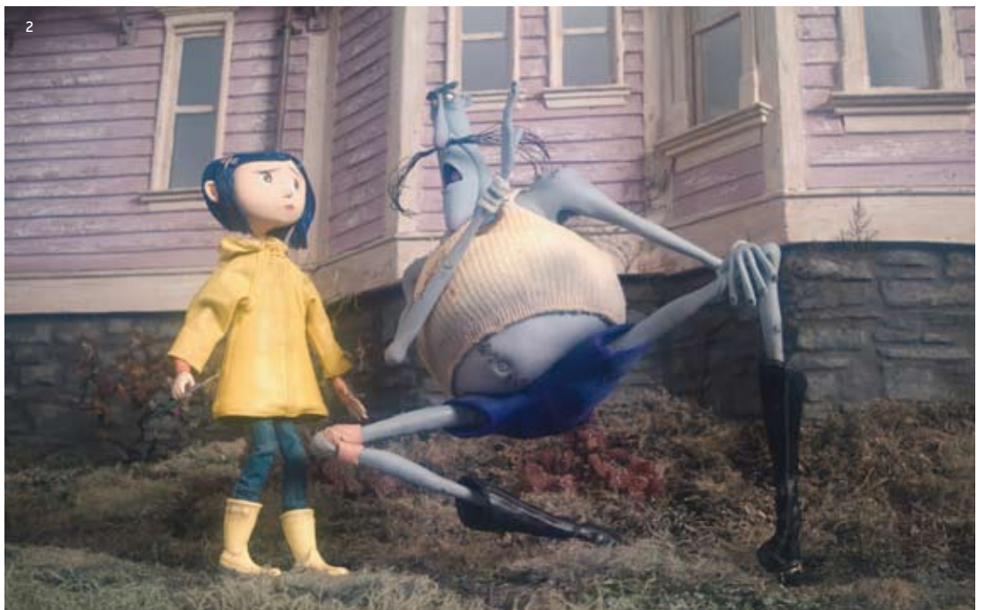
2 Coraline with Mr Bobinsky from the film Coraline, with costumes by Deborah Cook, 2009