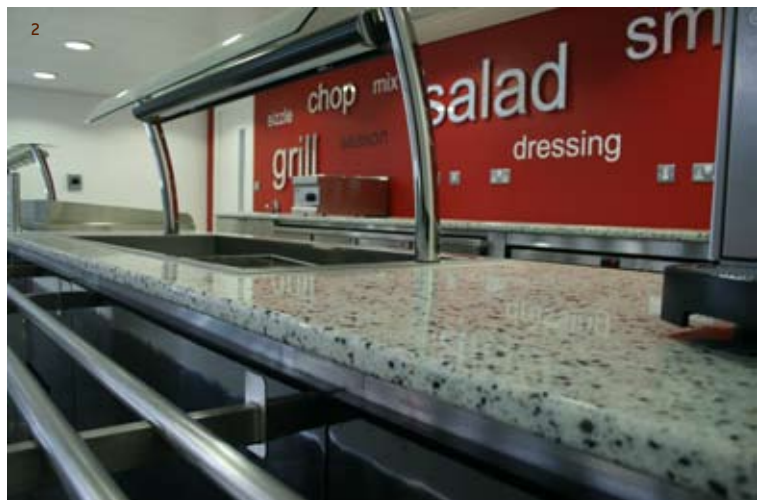
2 TTURA/Resilica™ counter top for Department of Health Headquarters, Whitehall, London, 2008