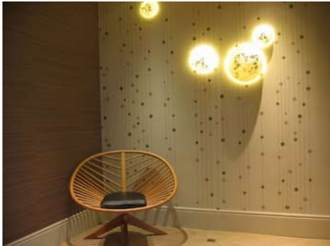
Solas GoldLeaf – fine bone china lights, Cj O'Neill, 2005